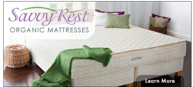
Savvy Rest Organic Mattresses